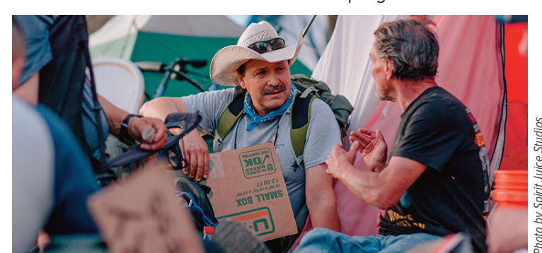
To learn more, click here to read coverage in the June issue of Columbia.

For three days and two nights, a group of 26 men — including 22 Knights — hit the streets of Austin, Texas, carrying only backpacks with toiletries, medicine and sleeping bags. During that time, they slept outdoors and made cardboard signs to beg for money to buy food. This "street retreat" with the homeless is a part of the Diocese of Austin's diaconate formation program. WATCH VIDEO